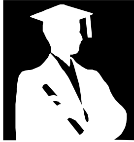
Enter to learn; Depart to Serve

We participated in sessions regarding updates in patient management and diseases, continuing medical education, career professionalism and