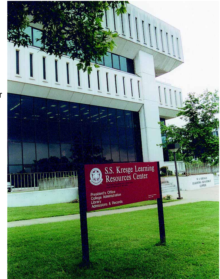
Building Number 7, Stanley S. Kresge Learning Resources Center